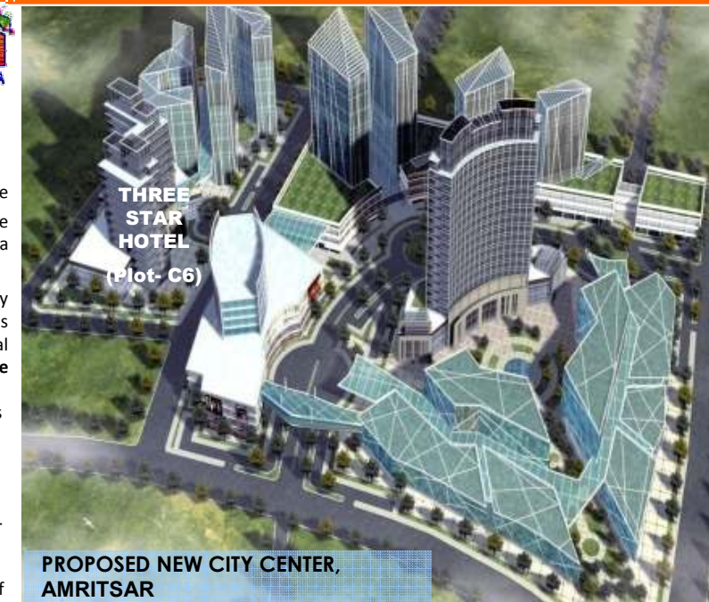
PROPOSED NEW CITY CENTER, AMRITSAR

Punjab Infrastructure Development Board (PIDB) and Punjab Urban Planning & Development Authority (PUDA), in its vision to tap the tourism potential of Amritsar, and to enhance infrastructure in the city, intends to develop a hotel with minimum Three Star rating in the proposed New Amritsar City Centre under Public Private Partnership (PPP) format. Feedback Ventures is the project development advisor to Punjab Infrastructure Development Board.